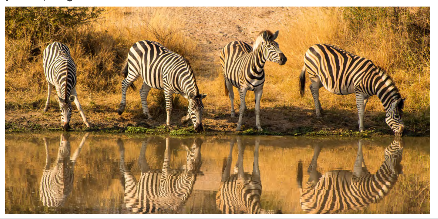
Day 9 - 12 | Kruger Park

Electricity/power available: 220V. Converters are also available and hair dryers are supplied in each suite. Children over the age of 10 are welcome. There are babysitting services available and tailor-made activities to suit each family. In the interest of safety, childrens' participation in game activities is at the discretion of your guide.