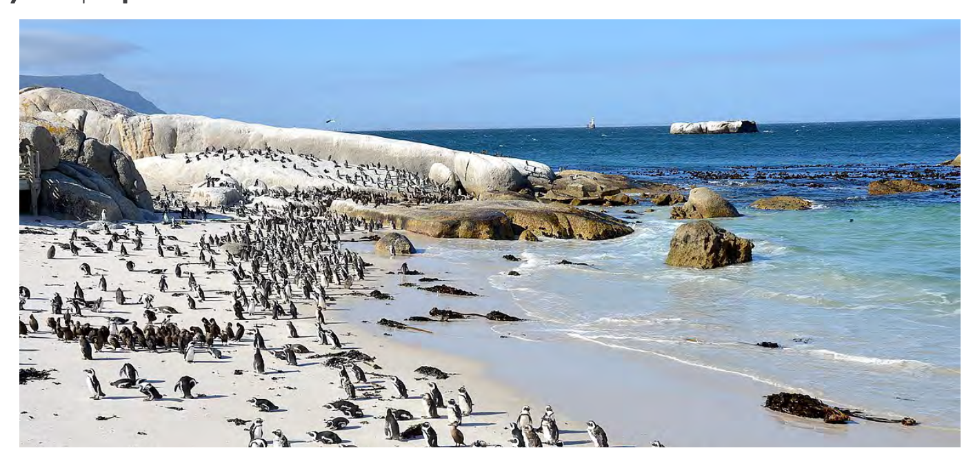
African Penguins on Boulders Beach